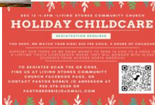
LIVING STONES COMM. CON NYC Fundraiser