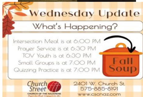
Church Street CON